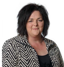
Kate Storey Realty (03) 6265 3000

Price : $ 390,000 Building Size : 122 sqm Land Size : 675 sqm View : https://www.katestoreyrealty.com.au/sale/tas/hobart-southern/eaglehawk-neck/residential/house/6013221