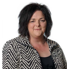
Kate Storey Realty (03) 6265 3000

Price : $ 390,000 Building Size : 122 sqm Land Size : 675 sqm View : https://www.katestoreyrealty.com.au/sale/tas/hobart-southern/eaglehawk-neck/residential/house/6013221