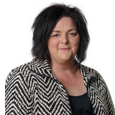
Kate Storey Realty (03) 6265 3000

Building Size : 203 sqm Land Size : 2263 sqm View : https://www.katestoreyrealty.com.au/sale/tas/hobart-southern/white-beach/residential/house/5780680