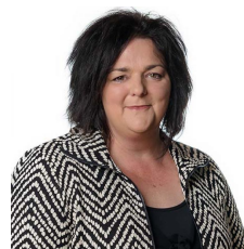
Kate Storey Realty (03) 6265 3000

Building Size : 203 sqm Land Size : 2263 sqm View : https://www.katestoreyrealty.com.au/sale/tas/hobart-southern/white-beach/residential/house/5780680