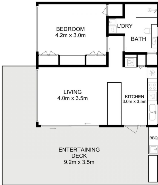
(Approx. floor area: 52 sqm)