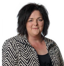
Kate Storey Realty (03) 6265 3000

Building Size : 20 sqm Land Size : 2297 sqm View : http://www.katestoreyrealty.com.au/sale/tas/hobart-southern/carlton/residential/house/7371642